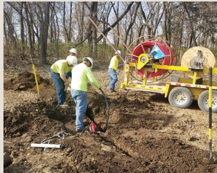
Lineman installing new primary underground cable to a new service.