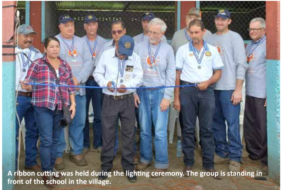
A ribbon cutting was held during the lighting ceremony. The group is standing in front of the school in the village.