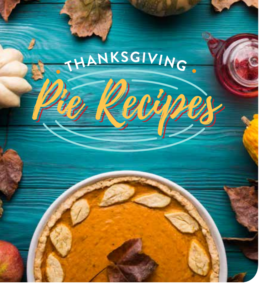
Tips source AllRecipes.com