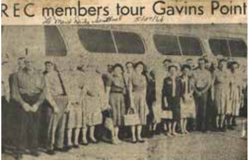
THIS GROUP of Plymouth countyers county Rural Electric Cooperative, INP article Cooperative, INP photol