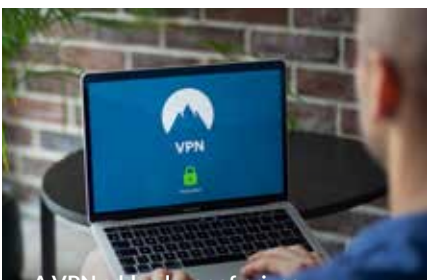
A VPN adds a layer of privacy protection to your online interactions by routing your traffic through an encrypted connection.

Electric cooperatives are working together and with their local generation and transmission (G&T) cooperatives, statewide organizations and the National Rural Electric Cooperative Association (NRECA), the national trade association for electric cooperatives. Together, they're leading efforts to establish relationships, provide tools, share resources and training information to harden and improve the overall cyber landscape.