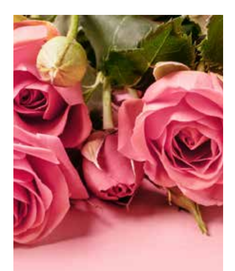
From Grundy County REC!

More information will be shared in the June edition of lowa Electric Cooperative Living .