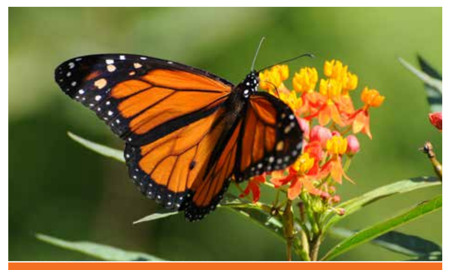
Through the Iowa Monarch Conservation Consortium (monarch.ent.iastate.edu), electric cooperatives are working to restore declining populations of the monarch butterfly. You can help, too, by planting a pollinator habitat!

The soil type and the amount of sunlight it gets will help determine the